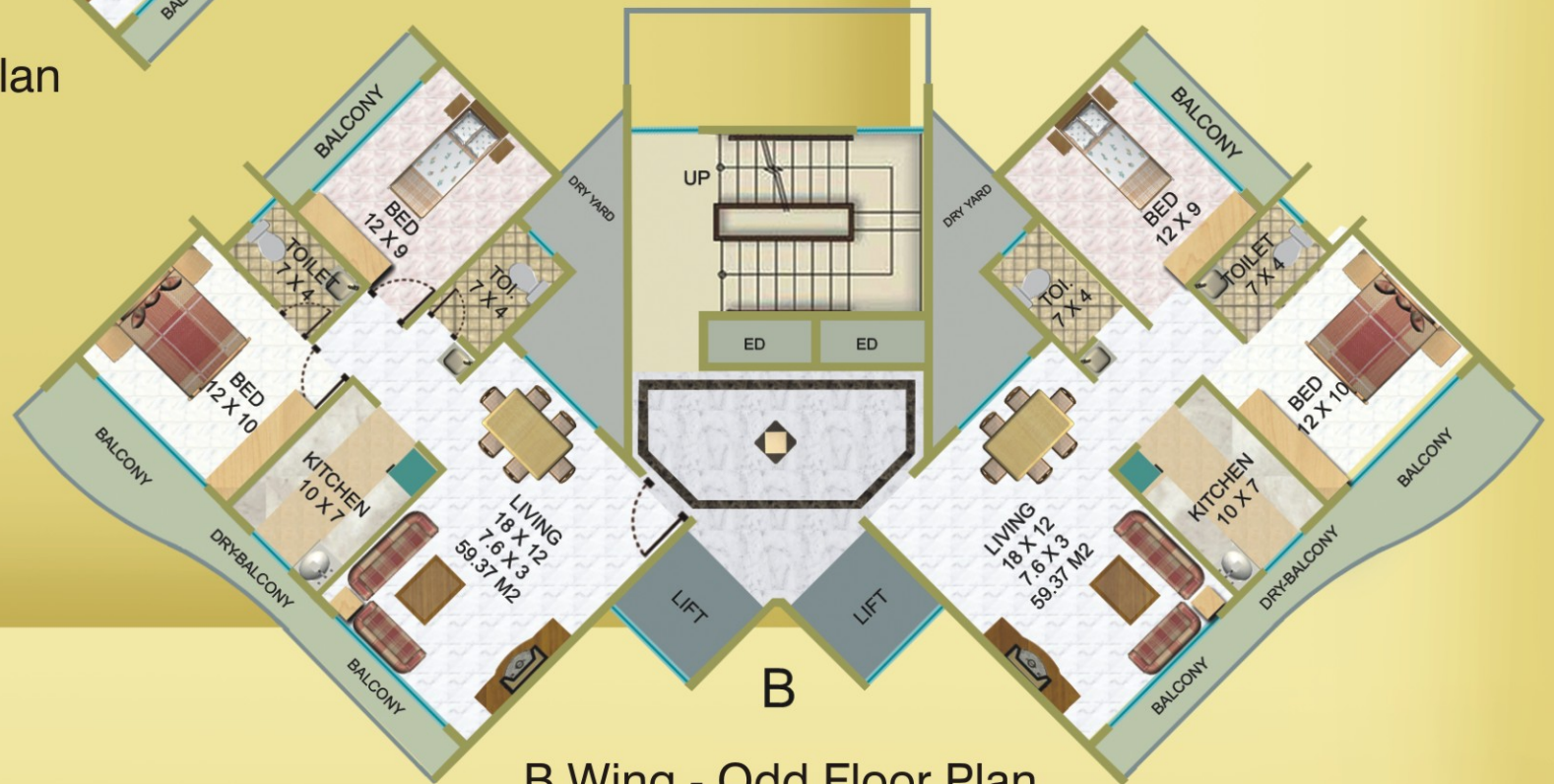
B Wing - Odd Floor Plan 3rd, 5th, 7th, 9th & 11th