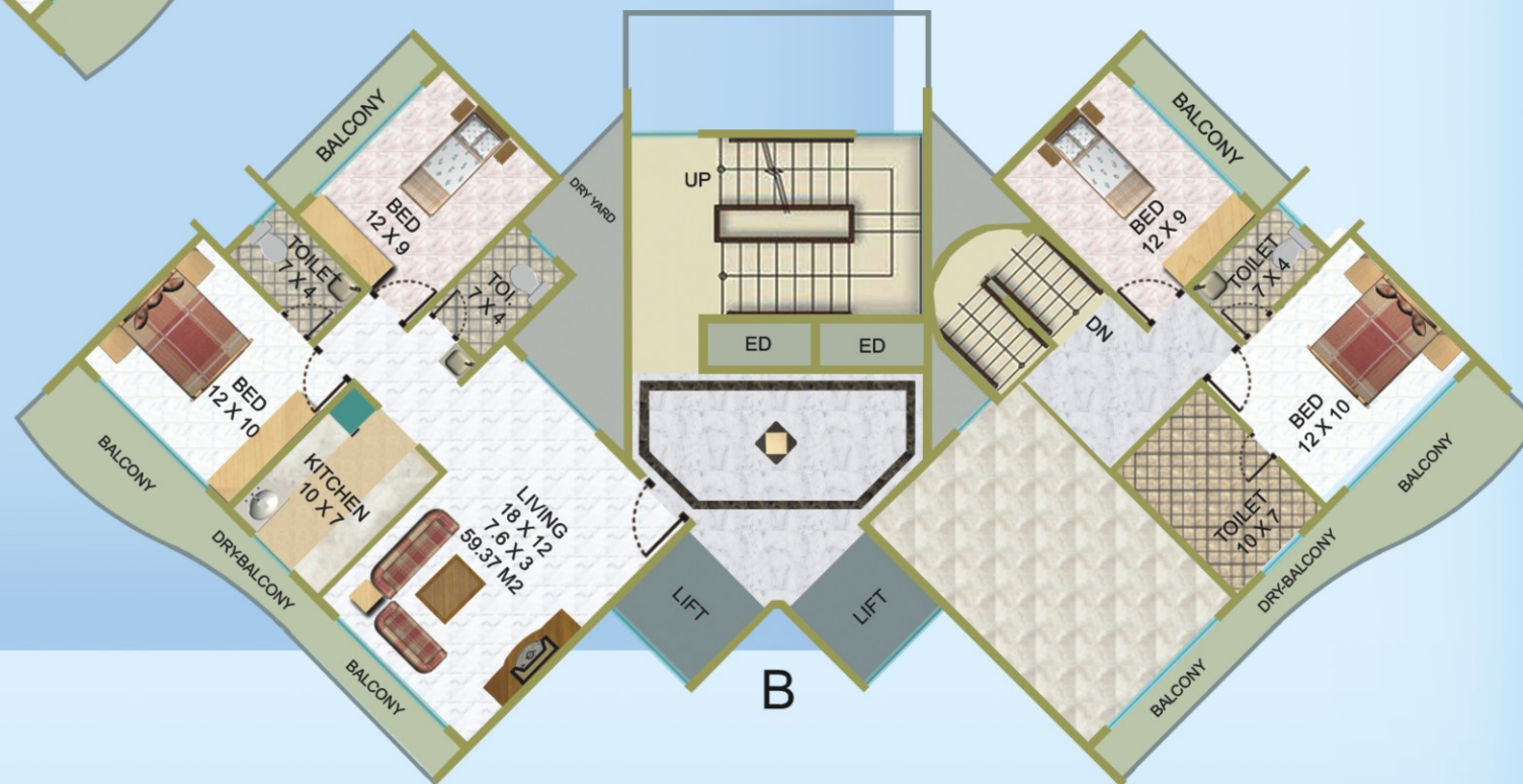
B Wing - 14th Floor Plan