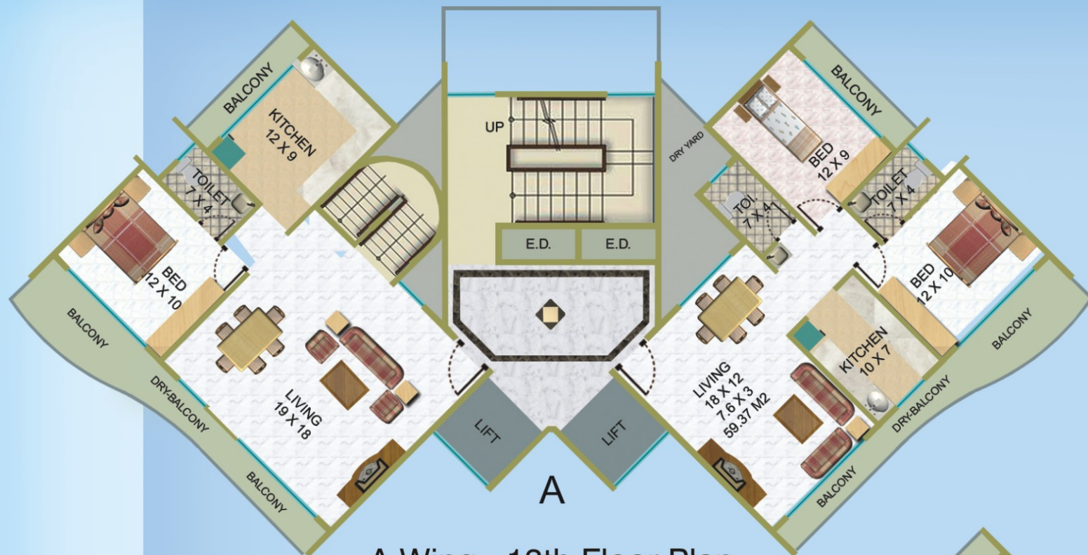
A Wing - 13th Floor Plan