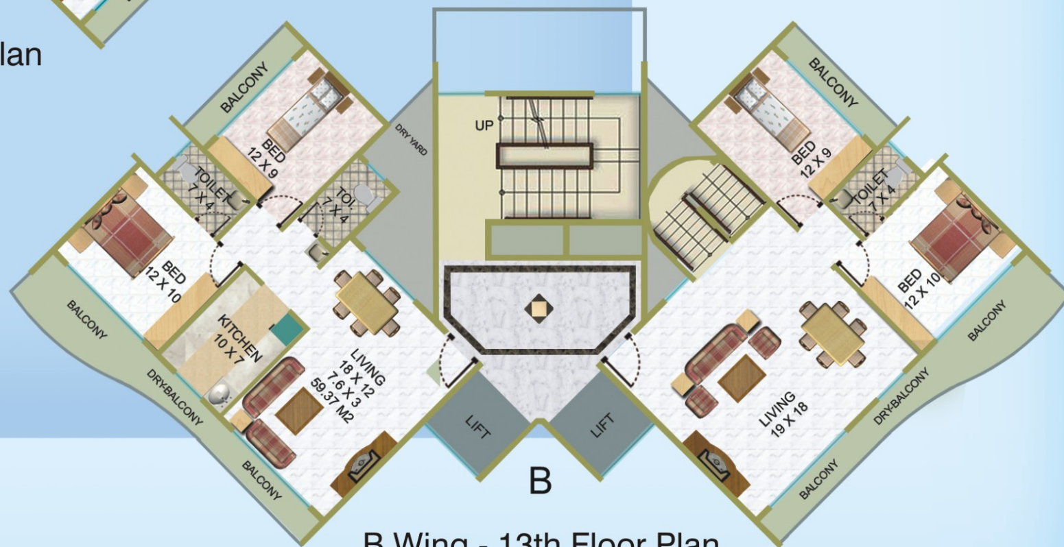
B Wing - 13th Floor Plan