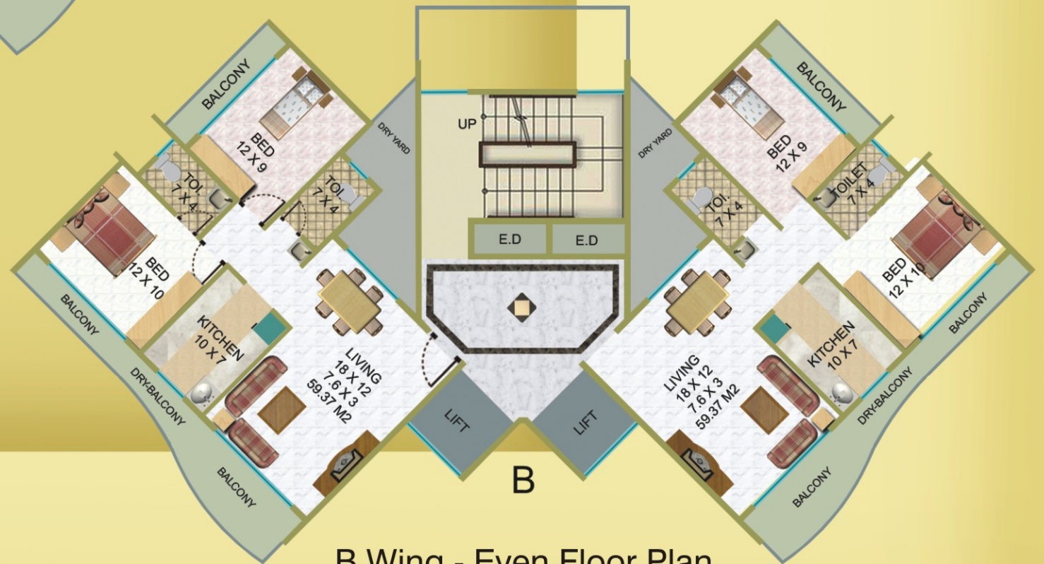
B Wing - Even Floor Plan 2nd, 4th, 6th, 8th & 12th