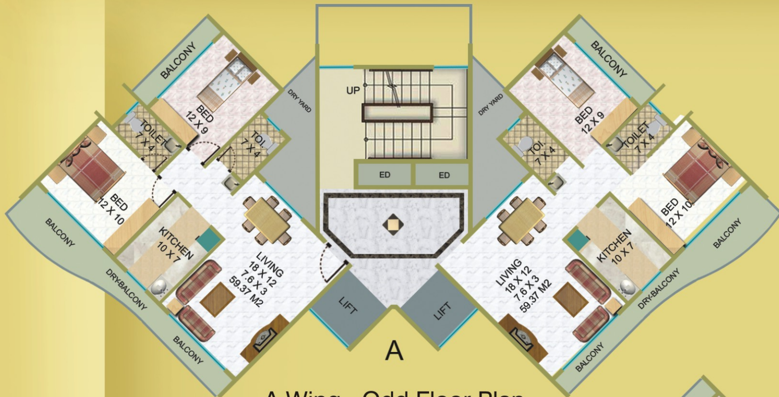
A Wing - Odd Floor Plan 3rd, 5th, 7th, 9th & 11th