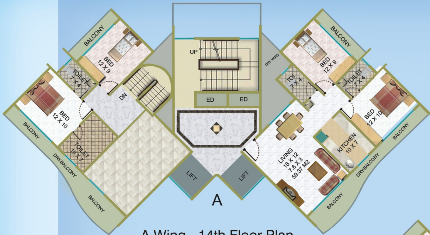
A Wing - 14th Floor Plan