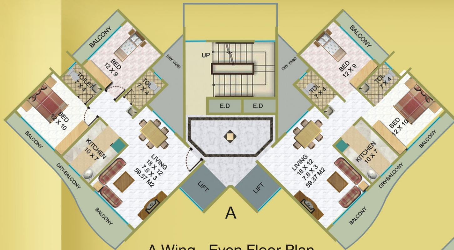
A Wing - Even Floor Plan 2nd, 4th, 6th, 8th & 12th